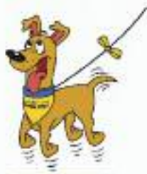
...pup in training.

There are many reasons why a dog may need space: