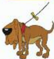
...old & grumpy.