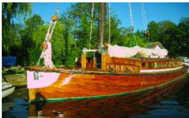
Ardea moored beside the river