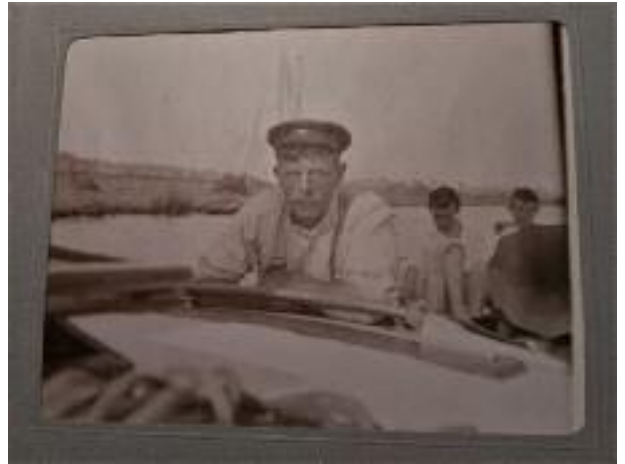
A boating holiday on the Broad's in 1910