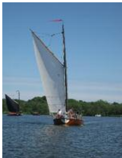
Ardea sailing on Wroxham Broad in 2012 with Hathor in the background